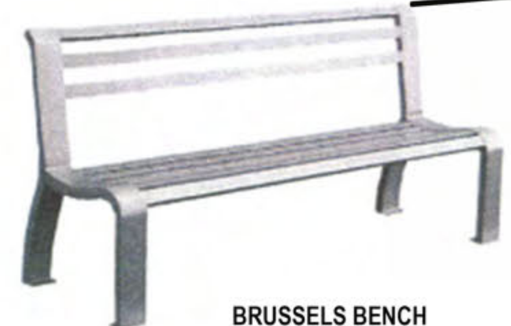
BRUSSELS BENCH CANTERBURY INTERNATIONAL SILVER POWDER COAT FINISH 6'W 1' X 2' SLATS