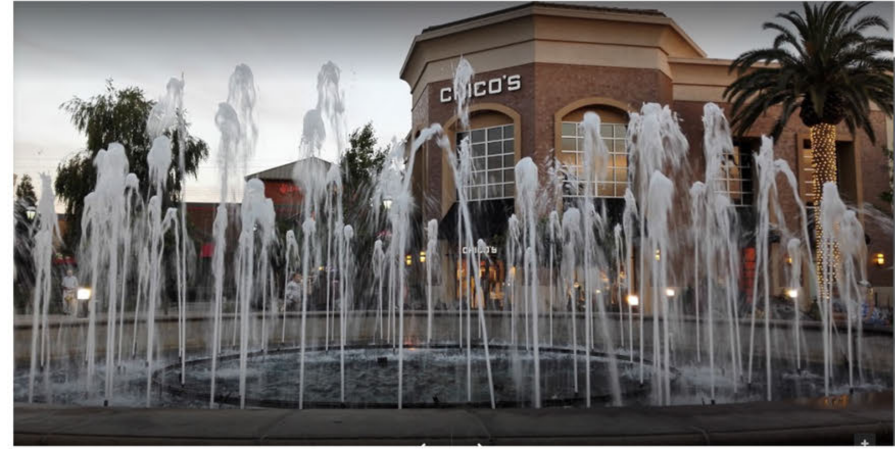
NOTE: SHOWN FOR DESIGN INTENT ONLY, FOUNTAIN DESIGN TO BE DETERMINED UNDER FUTURE PERMIT.